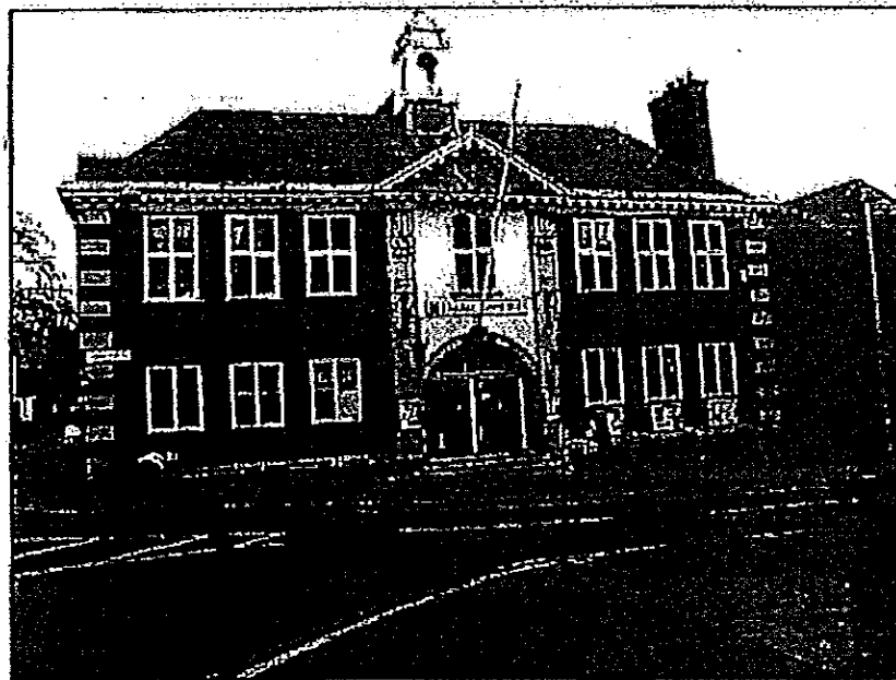
BATTLEGROUND: Hitchin Town Hall

This was a scrutiny meeting and the affairs in question should have been scrutinized, they were not.